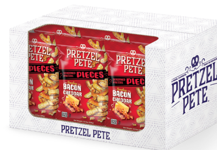
Example of Knock-out Display Case