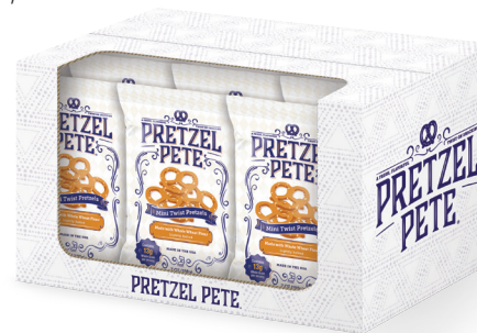
Example of Knock-out Display Case

Pretzel Pete is pleased to offer this range of options and here's the kicker – they are DELICIOUS!!