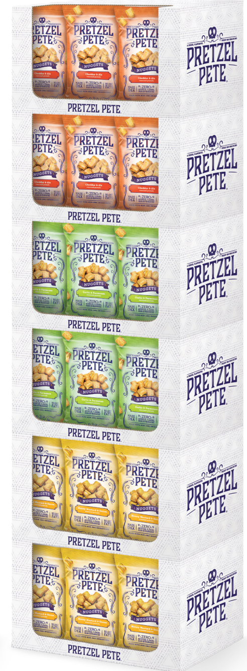
Example of Knock-out Display Case

The seasoning soaks through the shell and into the crevasses of the split in each nugget providing the “wow” flavor. The bite-sized nuggets are perfect when entertaining or as a delicious snack for anyone looking to snack “smart.”